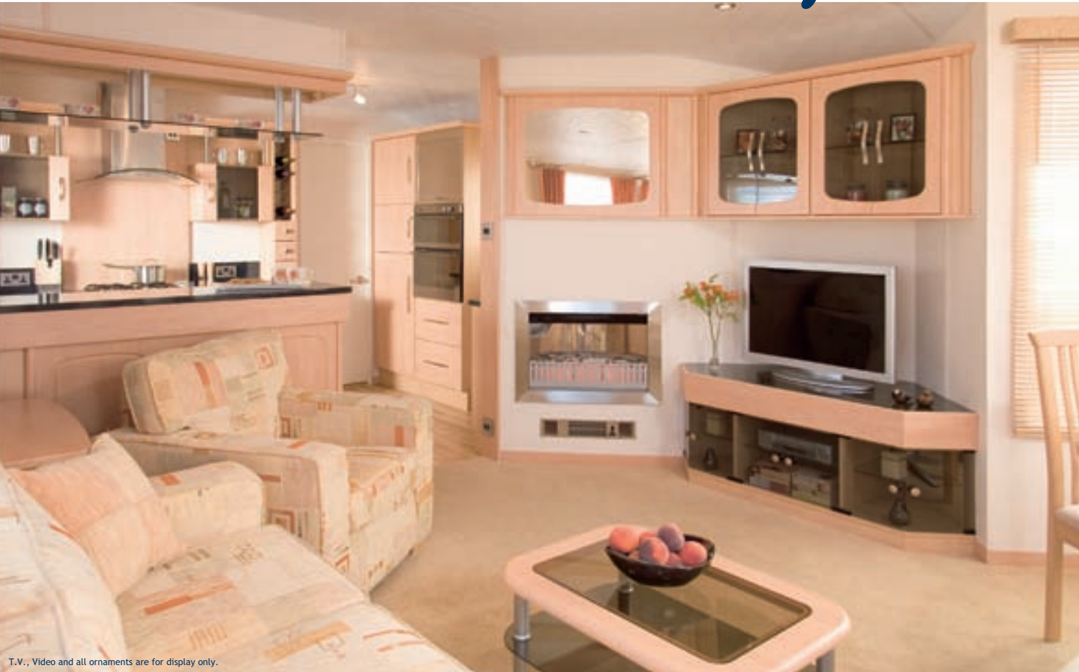
T.V., Video and all ornaments are for display only.