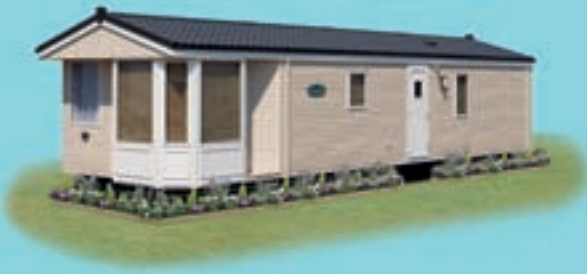
Model illustrated is the Oakwood Super 39/2 bedroom.